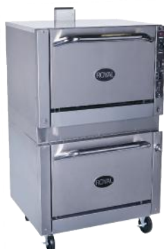
RR-36-DS-C shown with optional casters

Models: RR-36-LB RR-36-LB-C RR-36-DS RR-36-DS-C* RR-36-DS-CC