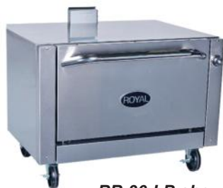
RR-36-LB shown with optional casters