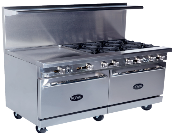
RR-6G24 with optional casters

Models: RR-10 RR-8G12 RR-6G24 RR-4G36 RR-2G48 RR-G60 RR-6RG24 RR-8GT12 RR-6GT24 RR-4GT36 RR-2GT48 RR-GT60