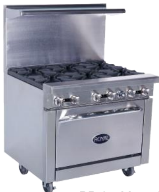
RR-6 with optional casters

Models: RR-6 RR-4G12 RR-2G24 RR-G36 RR-4-36 RR-4RG12 RR-6SU RR-4GT12 RR-2GT24 RR-GT36