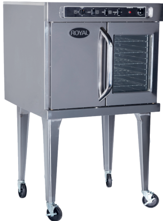
RECO-1 with optional casters

Models: RECO-1 RECO-2 RECO-6K-1 RECO-6K-2