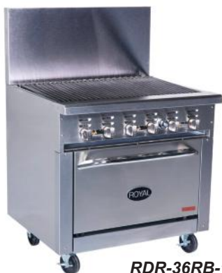
RDR-36RB-126 with optional casters

Models: RDR-24RB-120 RDR-24RB-XB RDR-36RB-126 RDR-36RB-XB RDR-48RB-126