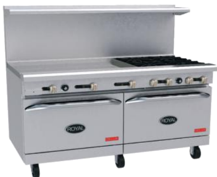
RDR-6G24 with optional casters

Models: RDR-10 RDR-8G12 RDR-6G24 RDR-4G36 RDR-2G48 RDR-G60 RDR-6RG24 RDR-8GT12 RDR-6GT24 RDR-4GT36 RDR-2GT48 RDR-GT60