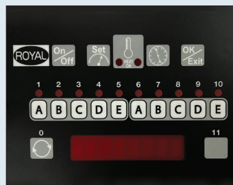
10-product computer control