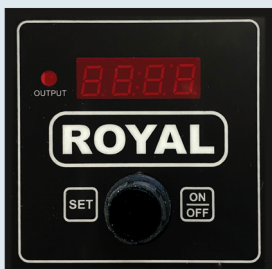
Digital solid state