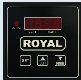
2-product solid state