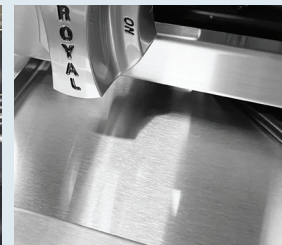
Stainless Steel Drip Pan