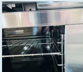
Stainless Steel Welded Frame