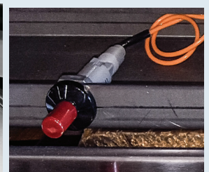
Piezo Spark Ignitor for Oven