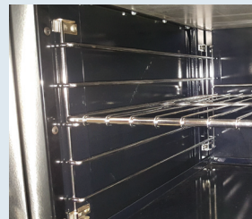
5-position Rack Guide