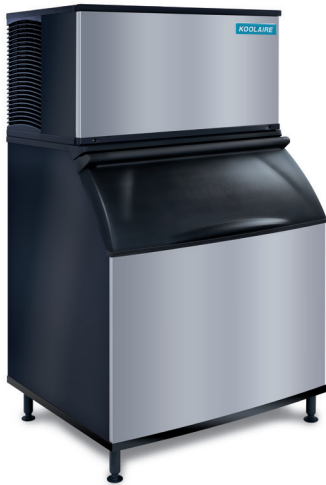
Koolaire KT-1700 Ice Kube Machine on K970 Bin

Koolaire by Manitowoc ice machines are designed, developed and tested by Manitowoc engineers to provide great ice production, energy efficiency and reliable service at an affordable price.