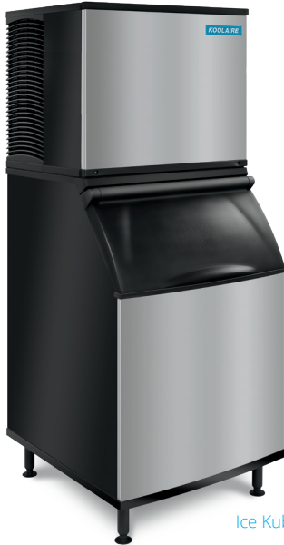
Koolaire KT-1000 Ice Kube Machine on K570 Bin

KDT-1000A KYT-1000A KDT-1000W KYT-1000W KDT-1000N KYT-1000N