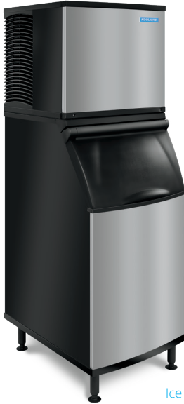
Koolaire KT-0420 Ice Kube Machine on K420 Bin

Koolaire by Manitowoc ice machines are designed, developed and tested by Manitowoc engineers to provide great ice production, energy efficiency and reliable service at an affordable price.