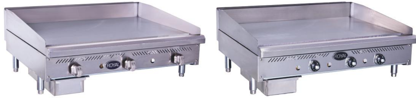
Manual Griddle and Thermostatic Griddle (Available in Snack Size)