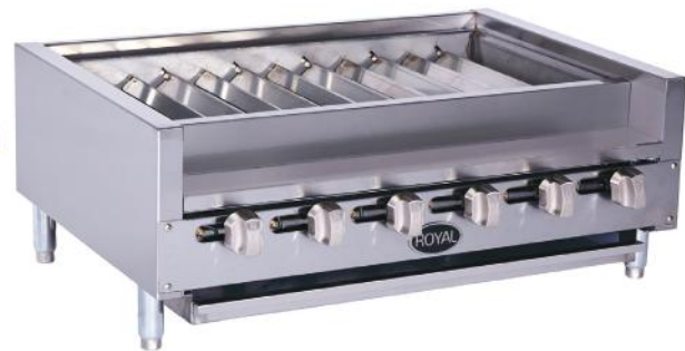
Kabob Turbo Broiler