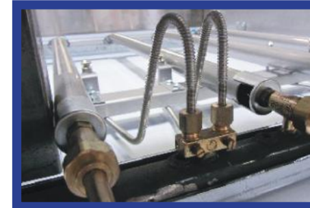
Stainless steel tubing with pilot