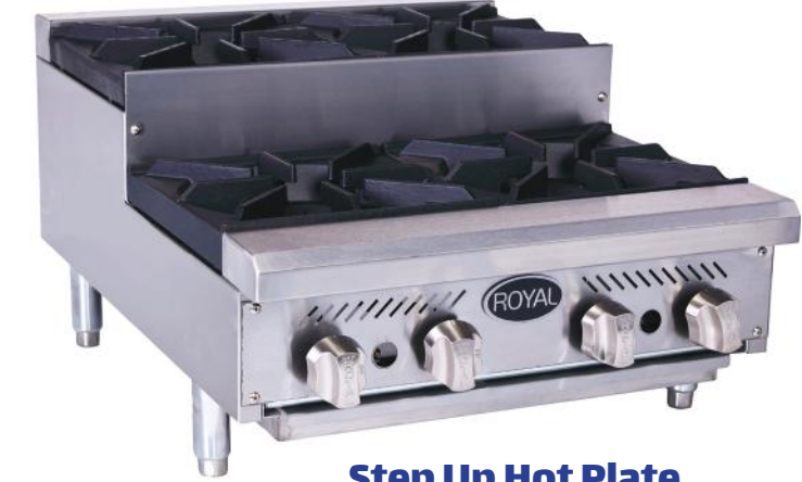
Step Up Hot Plate