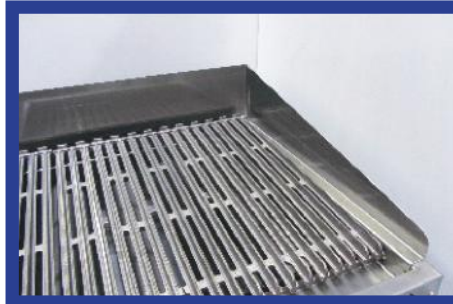
Heavy duty removable splash guards