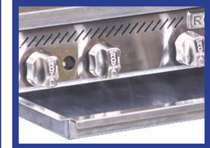
Full width, removable stainless steel crumb pan for easy cleaning