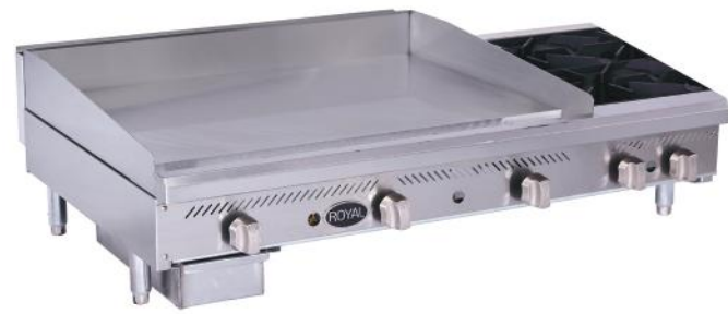
Griddle and Hot Plate Combo