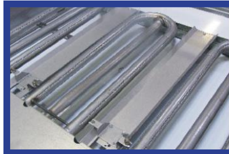
Aeration panels between the burners with secure pilots