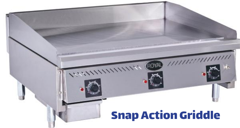
Snap Action Griddle