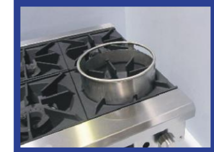
Removable wok ring (optional)