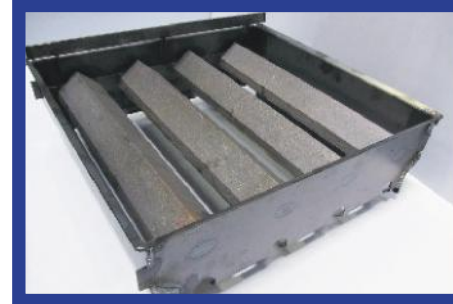
Easily removable independent firebox assembly