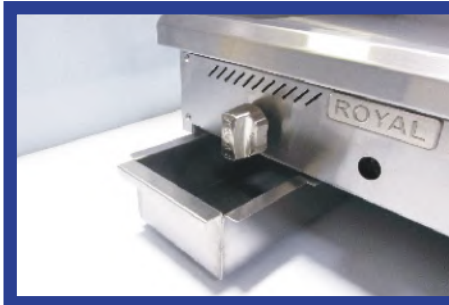
Large 1½ gallon capacity stainless steel grease can