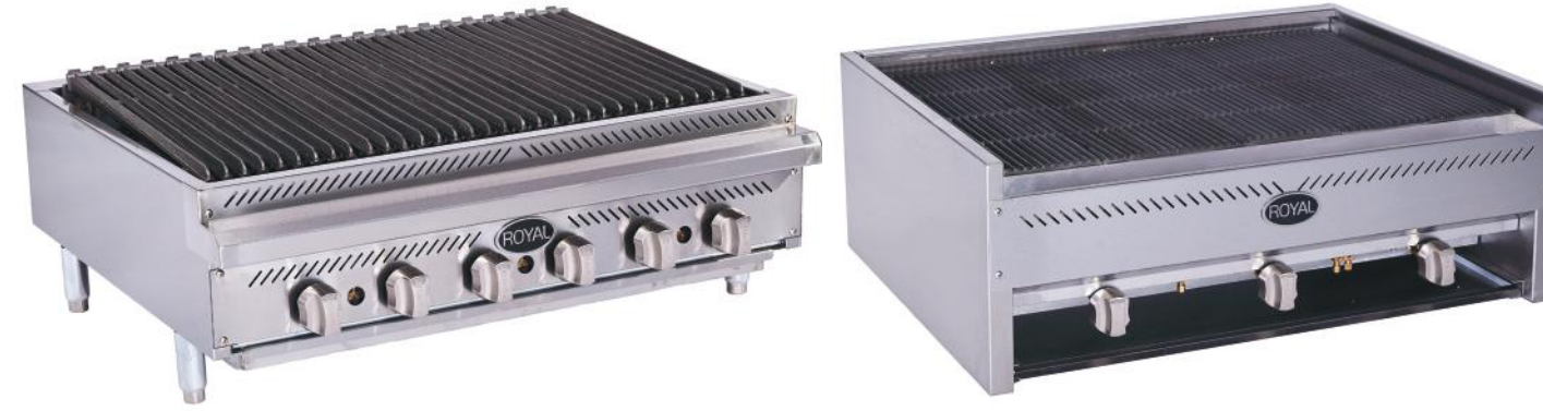
Radiant Broiler and Char Rock Broiler (Available in Snack Size)