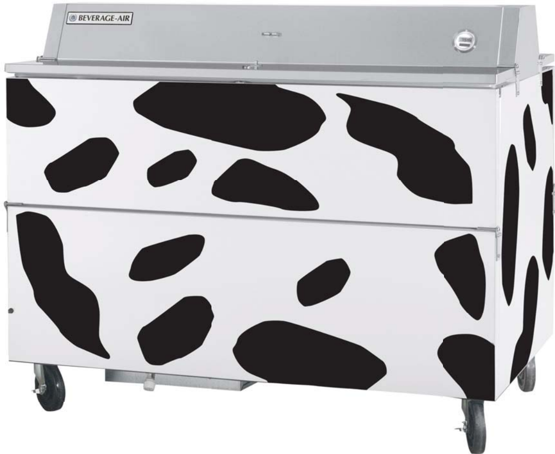
STF58-1-W Shown with optional cow graphics